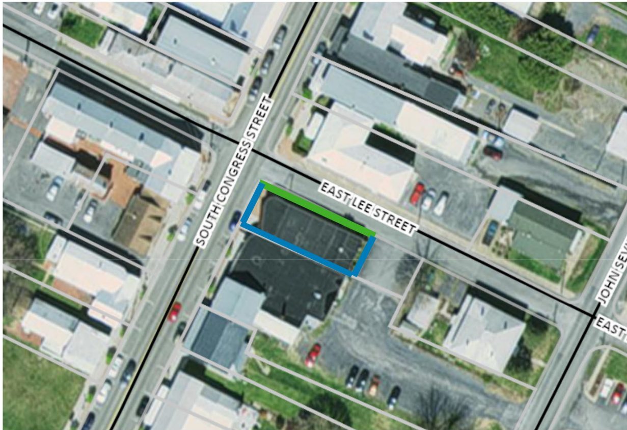
Mural Canvas Outline